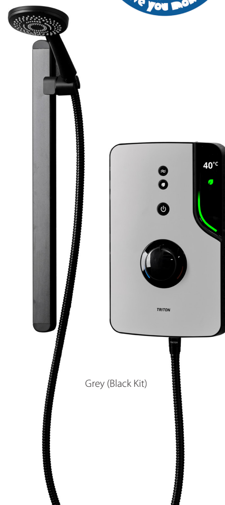
Grey (Black Kit)