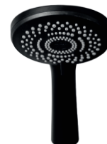
Enya - 5 Spray Matte Black GAENYSH3