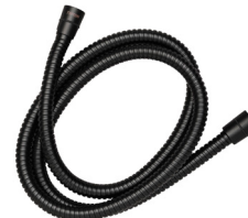
1.5m Anti-twist Hose - Matte Black TSHG150BLK